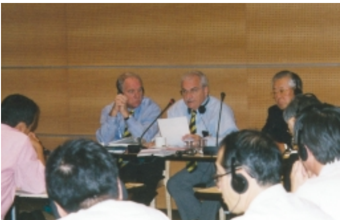
Meeting of the Co-ordination Committee