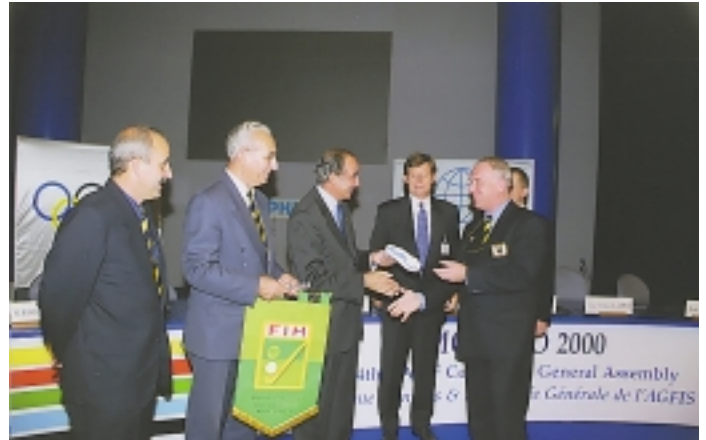
FIH President is presented the IWGA flag

The next AGM will take place in Singapore on Thursday 25th October 2001.