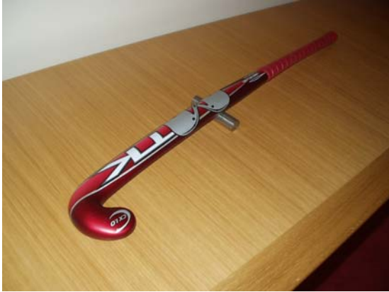
Rake/bow: a non-compliant stick