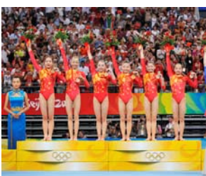
Team China