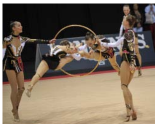
Group Ukraine