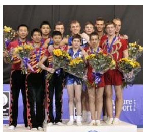
Men's Group podium