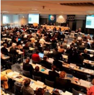
Marina Congress Center