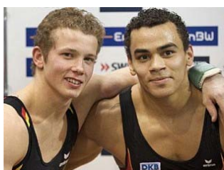
HAMBUECHEN Fabian & FAHRIG Matthias