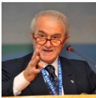
Prof. Bruno Grandi (ITA)