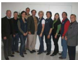
GFA Committee and OC Gym for Life 2009