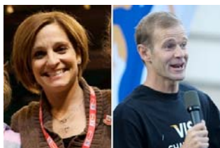
RETTON Mary Lou (USA) and VIDMAR Peter (USA)