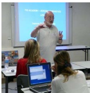
FIG Academy