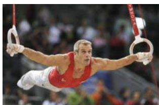
JOVTCHEV Jordan (BUL)