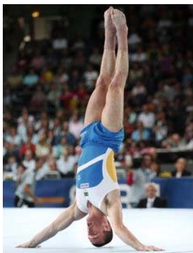
HYPOLITO Diego (BRA)